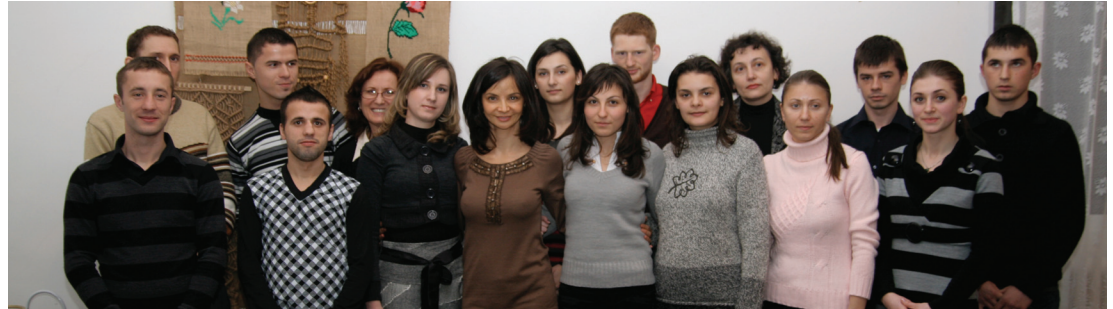
Blue Heron Scholarship recipients, Iasi 2009

For the past four years the efforts of our organization have been focused on the Blue Heron Foundation Scholarship Program. This program awards college scholarships to orphaned and abandoned young men and women who go on to study in Romanian universities. It is a one of a kind program, never before conceived or implemented in Romania.